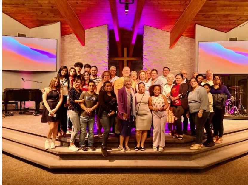
April 27, 2024 Movie Screening ( click here for more pics ) Akron Shalom Ministries Stowe, Ohio